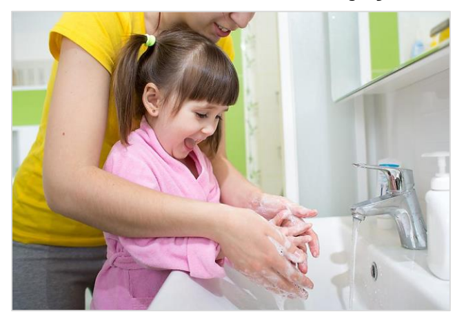
Now as then, deep love is expressed in the small acts of tenderly tending to each other's needs.